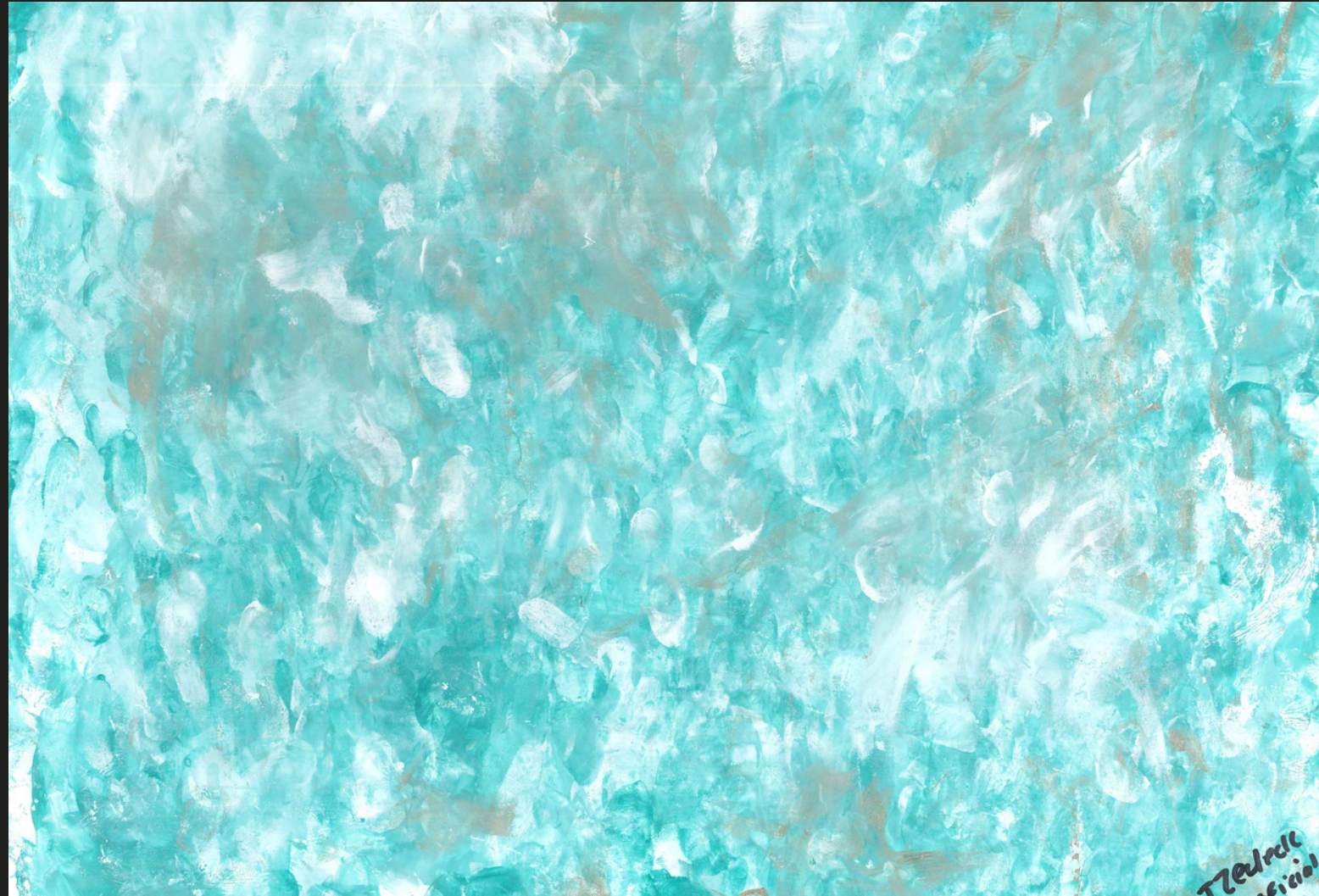
Splitting of the Sea